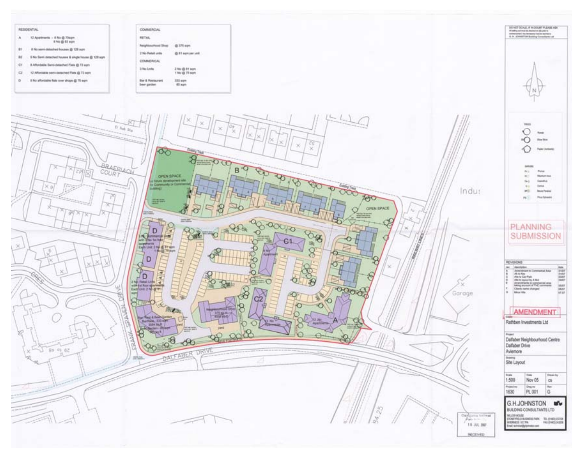
Fig. 5. Site Plan