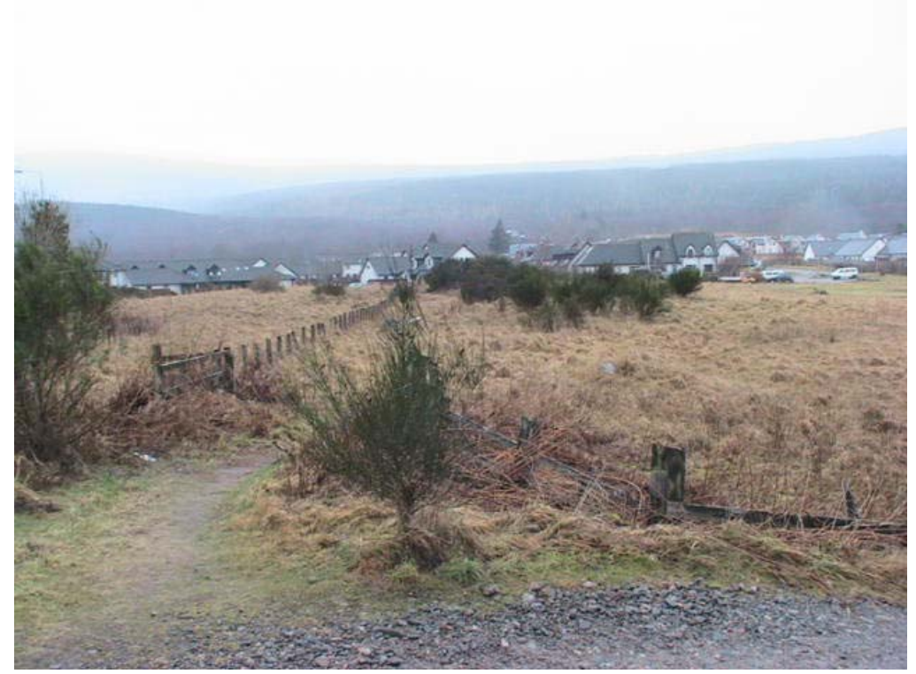
Fig. 4. Site looking westwards – Dalfaber Drive to left hand side