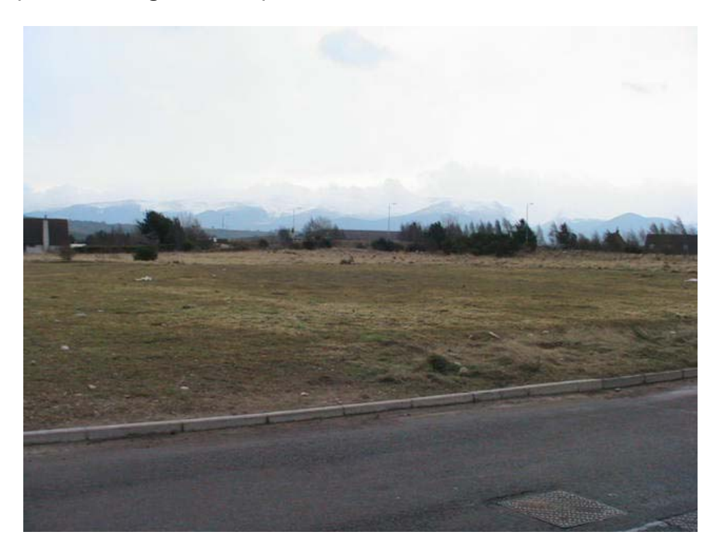
Fig. 2. Site looking south eastwards towards Dalfaber Drive

This site is a rectangular shaped vacant area of ground lying on the north side of Dalfaber Drive at its junction with Frank Spaven Drive in The site forms the last remaining area of Aviemore (Fig. 1.). undeveloped land in the wider Aviemore North area which has been extensively built out in mainly residential properties over the last few years. The site slopes gradually in a southwards direction but on its south boundary it sits below the level of Dalfaber Drive which rises up in an easterly direction. To the north boundary is an existing access track which separates the site from existing mixed single storey and 2 storey housing blocks which have their rear elevations facing the site. This access track turns southwards and runs down the east boundary of the site where three separate houses are situated adjacent to the railway line. To the north east corner beyond the site is an area of open space formed within the residential areas of the developments on the north side. Frank Spaven Drive which accesses the adjacent residential areas to the north and west runs down the west boundary (Photos at Figs. 2, 3 & 4).