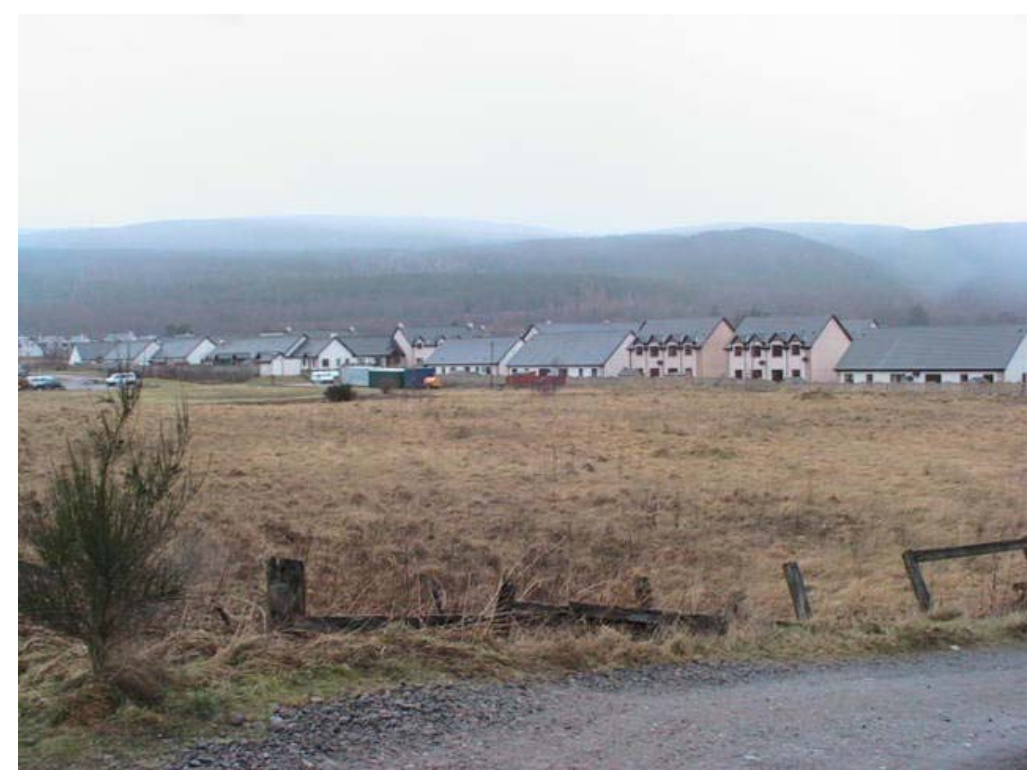
Fig. 3. Site looking north westwards towards existing housing and Frank Spaven Drive