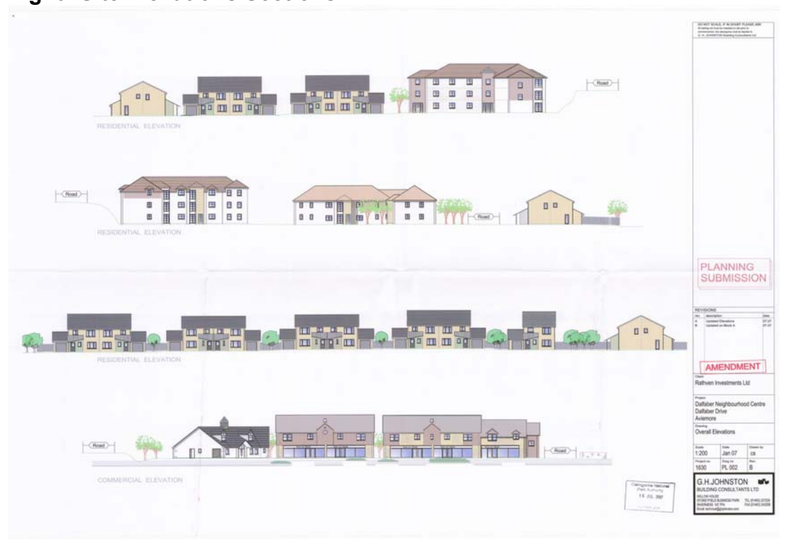
Fig. 6. Site Elevations/Sections